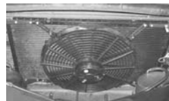
302686-CCA 1968-76 Corvette condenser fan kit (16" SPAL Unit)