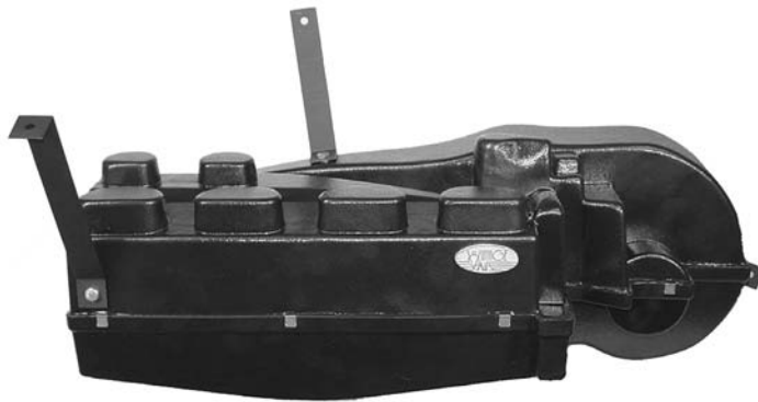
Gen-II Super 610050-VUA