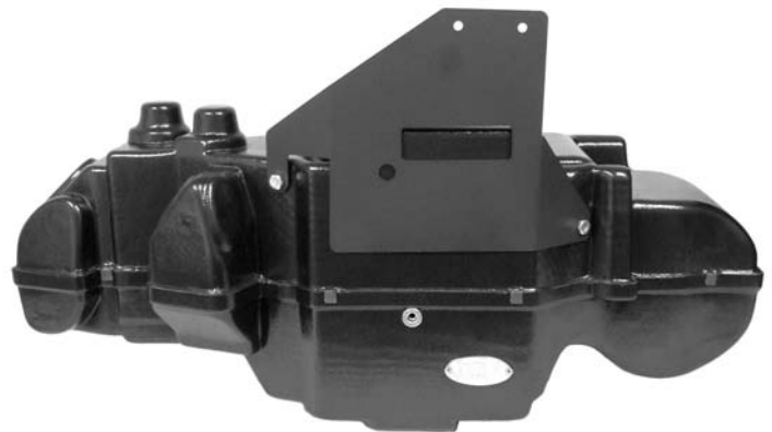
Gen-IV Magnum 671450

680051-VUA - Set of all three Gen-II mock-up units.