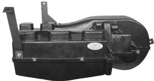
Gen-II Compac 680000-VUA